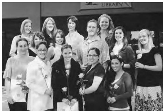
Santa Barbara Area Chapter's "Promising Educators of 2009" gathered outside the UC-Santa Barbara Davidson Library following their initiation March 7.